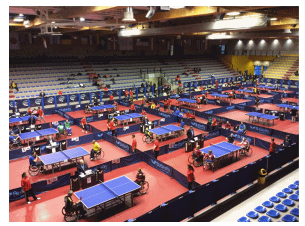
Sports Hall Ge. Tur. Training halls were in the same hall.