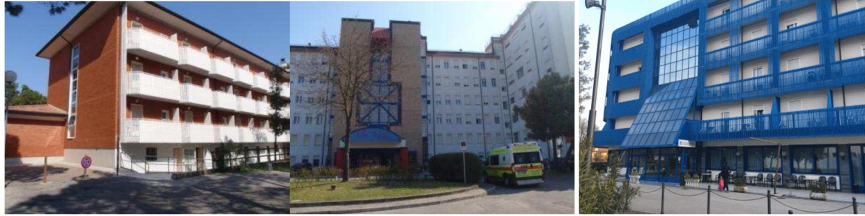
Hotel Santa Maria

All players and officials were staying at Villagio Turistico Sportivo EFA-GETUR, in hotels Alle Vele, Villa Primavera, Sole & Mare and Santa Maria close to the venues, accommodation was good. The hotels are full accessible for wheelchair players.