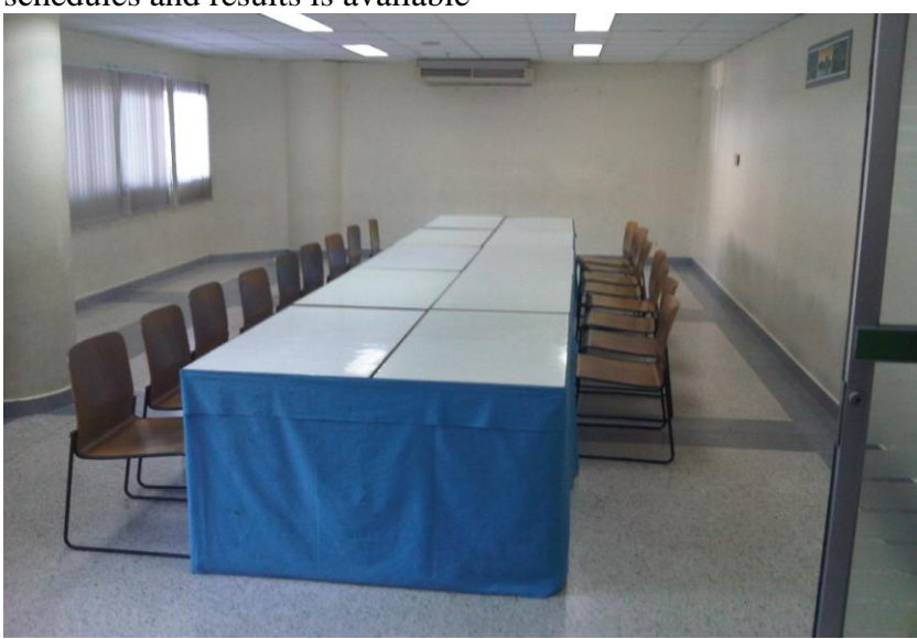
Technical meeting room

Meeting rooms: a meeting room for the technical meeting with a photocopier for schedules and results is available