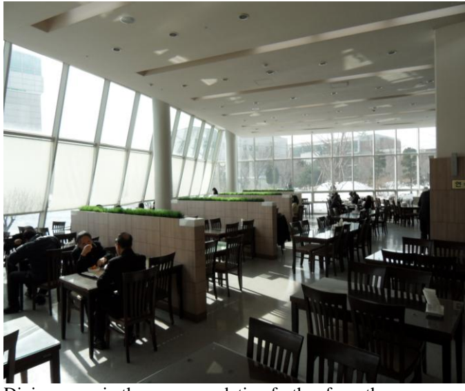
Dining room in the accommodation further from the venue

19h00 for dinner but these will need to be extended