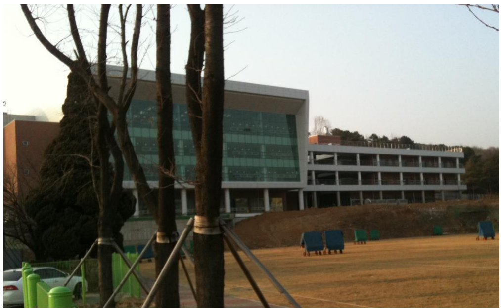
Building from the outside (above), playing area inside (below)

is available in the administration building