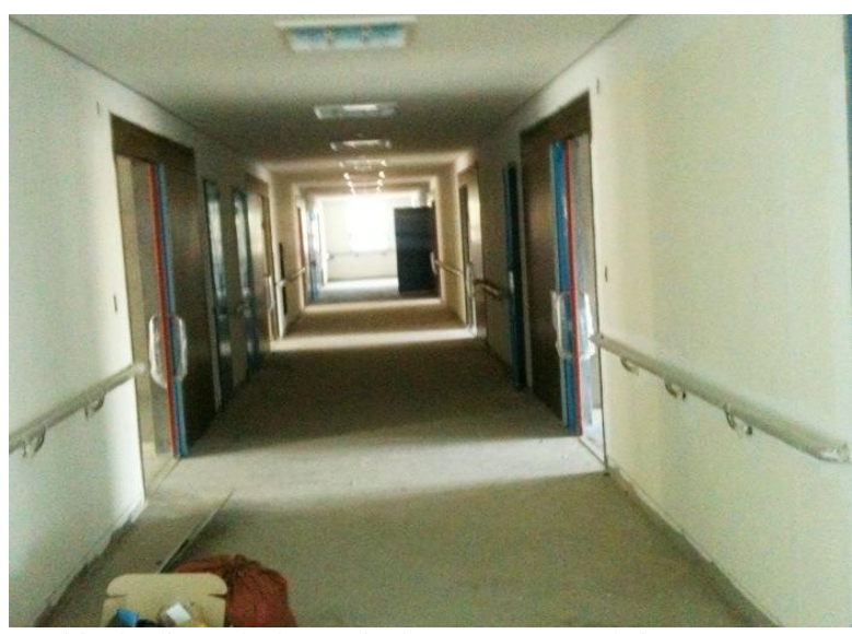
Corridor leading to bedrooms in the new accommodation

Width of entrance passage: 100cms Width of bathroom door: 100cms