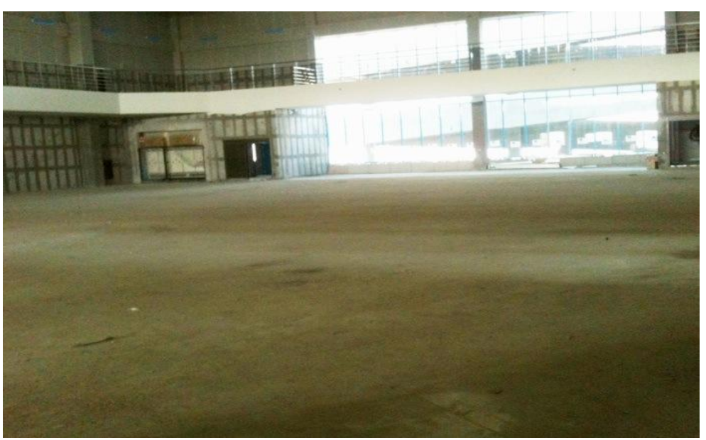
Offices (TD, referees): available either in the venue or the administration