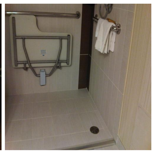
Type 1 room