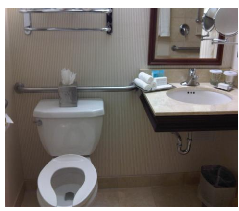
Shower and toilet facilities

Type 2 room: an accessible room with bath (17)