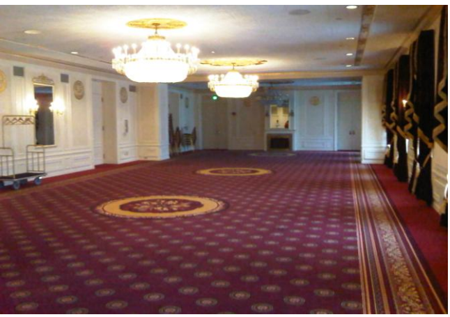
Possible dining room in the Hilton

Room: a meeting room will be used seating 100 to 125