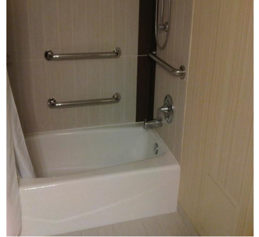
Type 2 room

Number of rooms in total: 481 rooms of which 10 are accessible.