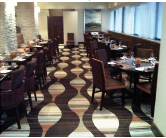
Dining area in the Hyatt

11h00-14h00 for lunch; 17h00-22h00 for dinner.