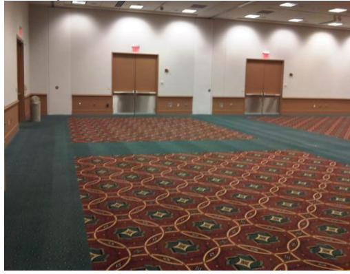
Possible classification area

Classification area: available in the mezzanine level in a meeting room