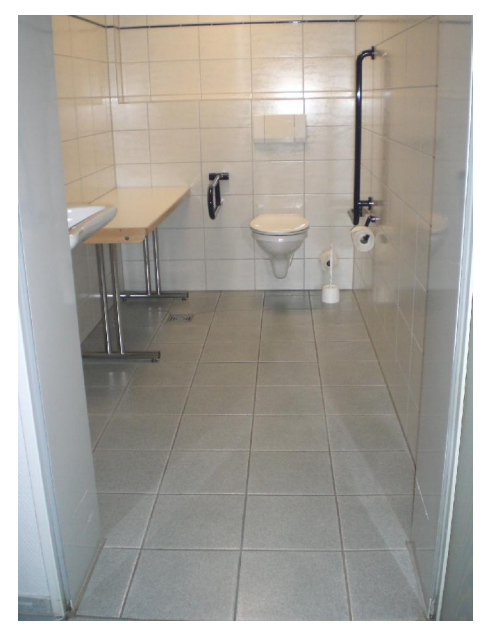
Accessible Public Restroom

The hotel is wheelchair users friendly in most of its public spaces. The doors of the lifts are 80cm wide and 2 may be 3 wheelchairs can be inside together. Accessible restrooms are available in the first floor and there are also accessible showers