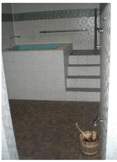
Sauna with a shower