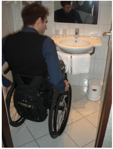
Bathroom in normal room

Normally a wheelchair could get through the doors but the rotation inside the bathroom could be difficult, the OC plans to provide special chairs for showers.