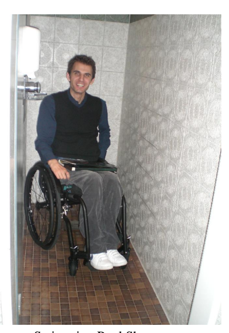
Swimming Pool Shower