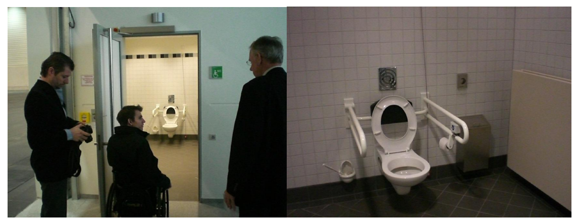
One of the accessible restrooms

There are restrooms on both of the shorter sides of the Venue accompanied by one accessible one each. It is possible to find 2 accessible toilets in the same hall but in a longer distance. The doors of the non-accessible toilets are 55cm wider.