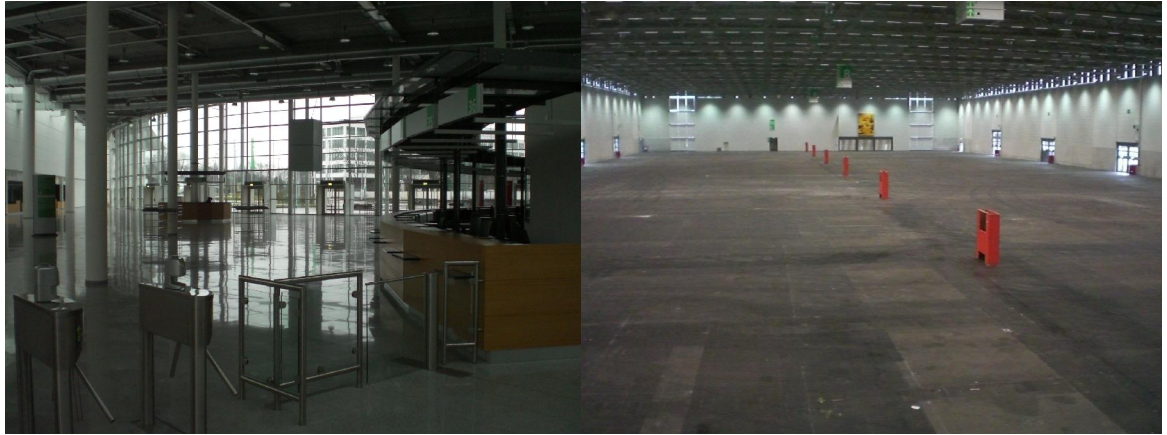
Entry to the Venue

The areas will be divided with wooden barriers. There are windows in the highest part of the venue; it is possible to cover them with an automatic system.