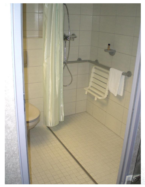
Bathroom of an accessible room

One way or another, there are accessible restrooms and showers in the first floor and in the swimming pool and sauna that can be used as well.