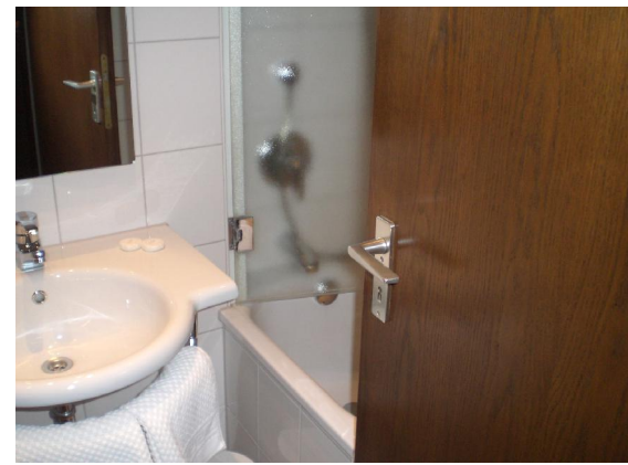
Bathtub behind the door with removable glass