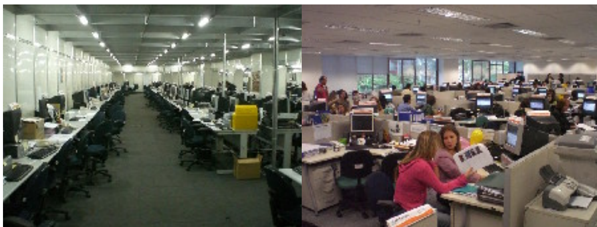
CORIO Offices located at Barra de Tijuca in Brazilian Olympic Committee building

* (These are not necessarily the responsible of the mentioned areas but they were the contact for table tennis)