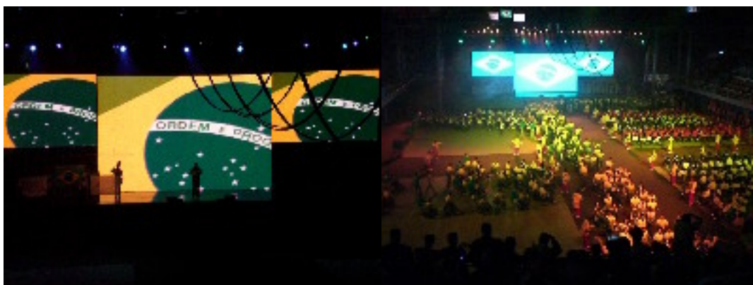
Brazilian Anthem performed by a guitar player / Marching of Brazilian Delegation

Ceremonies: The Opening ceremony was organised on 12 th of August with a marching of delegations, live music, acrobat shows and opening speeches. Superb level!