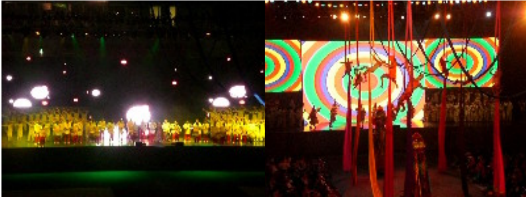
Live Music / Acrobat Show