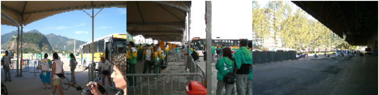
Exit to the transport center (1,2) – Arrival to the Venue (3)