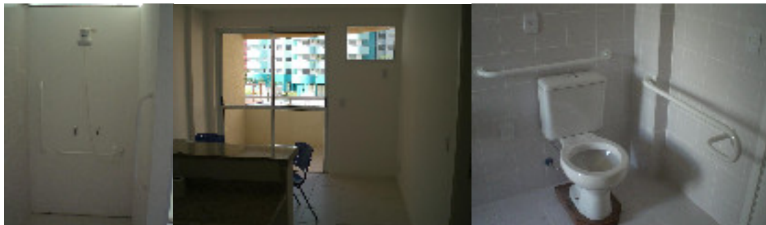
Pan-American Apartment – Accessible Bathroom

There were many extra services like laundry, info terminals, photocopying services, a TV room per building, recreational pool, Internet access rooms, storage rooms for the delegations, housekeeping, ecumenical service, internal newspaper and a fitness centre. There was an international area inside the village with a bank, post office, a bar, tourist services, orthopaedic repairing services, a disco, etc. There was also a medical centre and many offices for meetings and conferences. The service inside the village was just great. Paralympic Level.