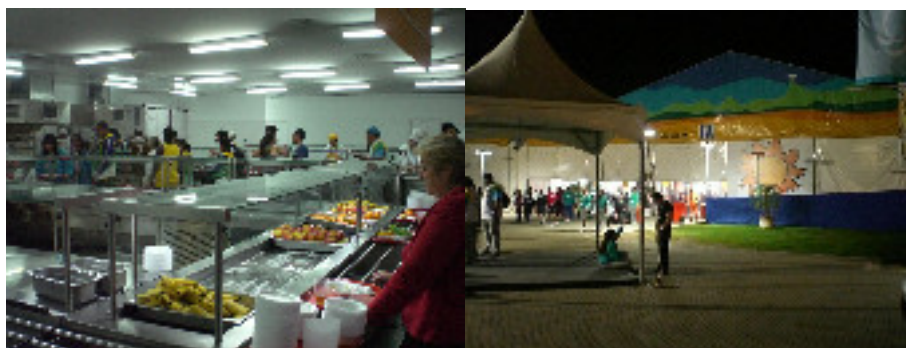
Restaurant at the Village

There was restaurant inside the village with 24 hrs service. The variety and quality of the food was very good, international, and with options for vegetarians. All descriptions of the food were in the 3 official languages (English, Spanish and Portuguese) and included the calories per serve. The delegations had the chance to ask for lunchboxes. It was also possible to have some snacks at the venue.