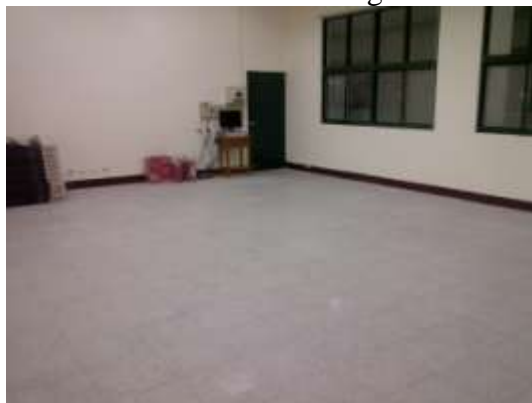
Floor non-slippery, not carpet

Room size: approximately 5m x 5m on the ground floor with sufficient space but consideration should be given to using a table in the training area