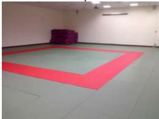
Athletes’ rest area

Rest areas (umpires, players): both are available but the players’ rest room will need a small ramp installed