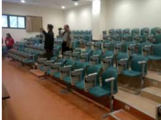
Technical meeting and umpires’ rest area

Gluing area: available on balcony Call area (“rule 51”): available behind the pillars on the competition floor Meeting room: is available on the ground floor theatre style with a projector for the technical meeting (draws to be done in the hotel). This will likely also be the umpires’ rest room