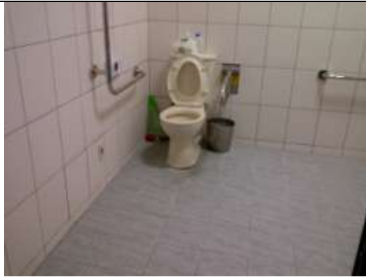
Wheelchair toilet on ground floor

Wheelchair storage: some space can be made available if necessary