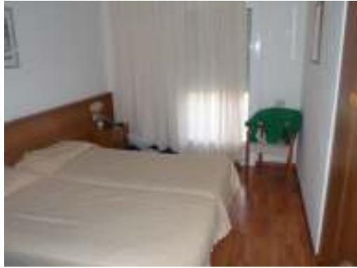
Room in one of the hotels