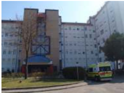
Hotel La Velle

Accomodation: All players and officials were staying at Villaggio Turistico Sportivo EFA-GETUR in hotels Sole Mare, Santa Maria, Orchidea, Pinetavery close to the venue, but accommodation was not so good. Also in some hotels water was stinking like rust. The hotels are full accessible for wheelchair players .