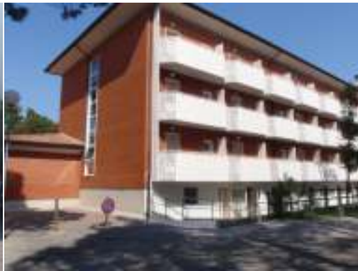
Hotel Santa Maria