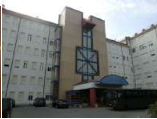
Hotel La Velle

Accreditation: They gave map with information's, T-shirt, water coupons, some presents, a bag and accreditation to all delegations.