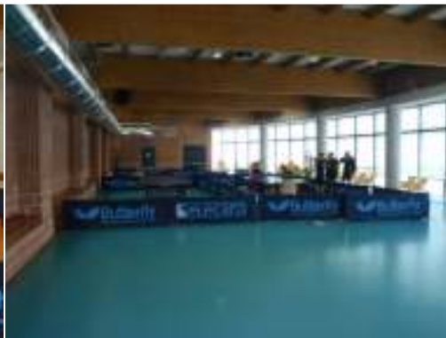
Training halls 1 and 2