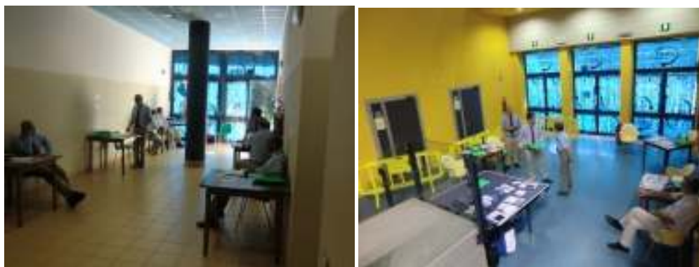
Call RoomCall Room