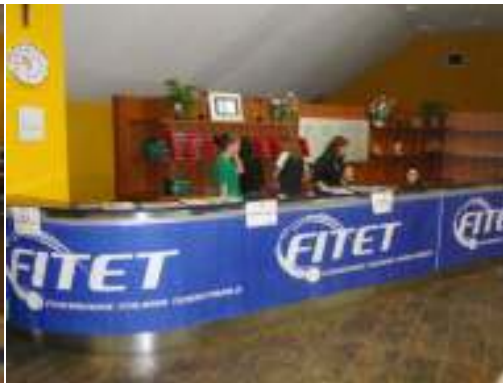
Pigion boxes, water supplies

The accreditation card it was a simple piece of paper in plastic.